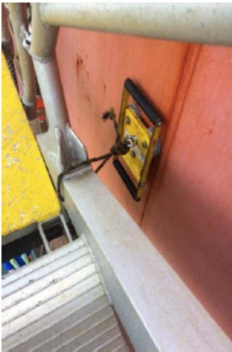
One magnet for accommodation ladder