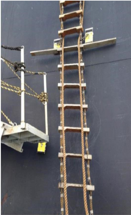
Magnets must be 1.5 metres above combination ladder platform